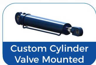
Custom Cylinder Valve Mounted